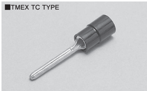
■ TMEX TC TYPE