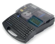
PROMARK-T1000 ▶ PAGE 100