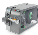
MK10-DH ▶ PAGE 108