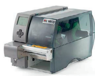
MK10 ▶ PAGE 106